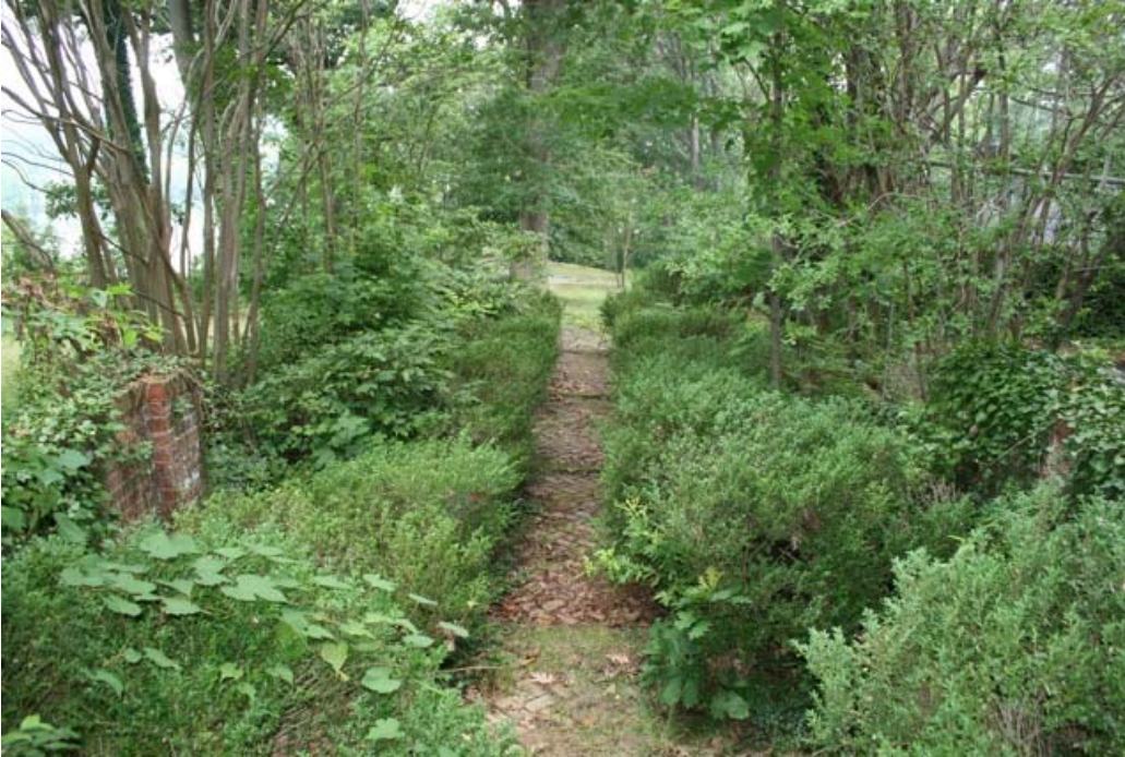
Allee Before : Shot taken July 2009