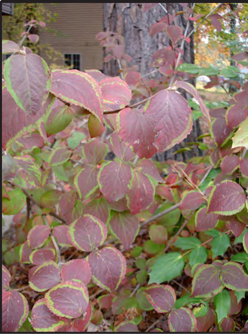
Viburnum x juddii